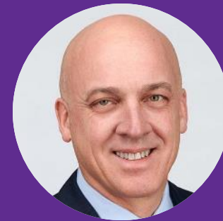
Albert Rex Ryan, LLC