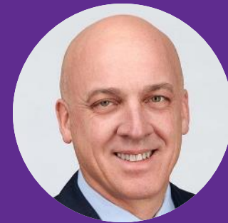
Albert Rex Ryan, LLC